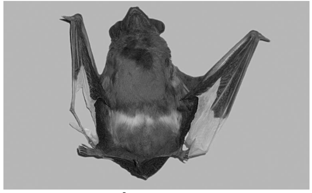
Fig. 1 – Noctule bat, Nyctalus noctula , ♀ with partial albinism. Soveja (Vrancea Co.); general aspect in ventral view.

As regards our report on an albinism case in a noctule bat from Romania, discolouring is like a transversal strip, on the belly (Fig. 1) and on both patagia tips (Figs 1, 2, 3).