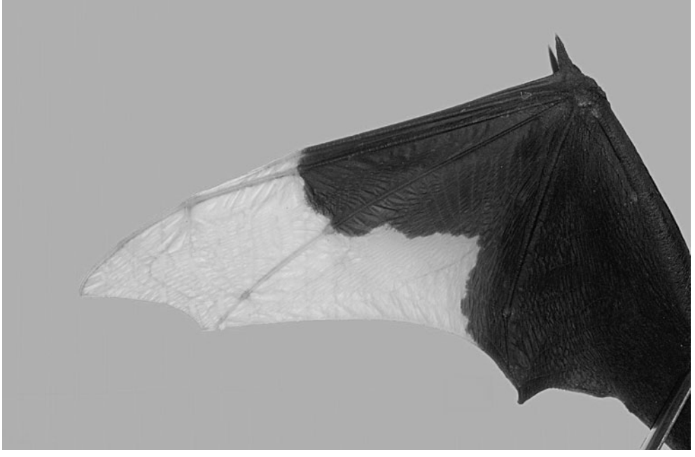
Fig. 3 – Noctule bat, Nyctalus noctula , \stackrel{Q}{\circ} with partial albinism. Soveja (Vrancea Co.); left wing in dorsal view.